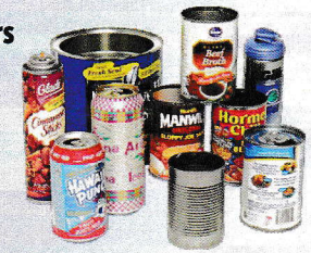
Aluminum & Metal Cans