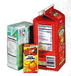
Paper Drink Cartons

Open to RRRASOC Member Communities: Farmington, Farmington Hills, Milford, Milford Township, Novi, South Lyon, Southfield, Walled Lake, Wixom