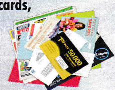
Greeting cards, regular & junk mail