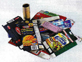
Paperboard boxes (cereal, pasta, & tissue)