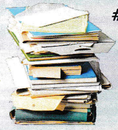
File folders, office paper & gift wrapping paper