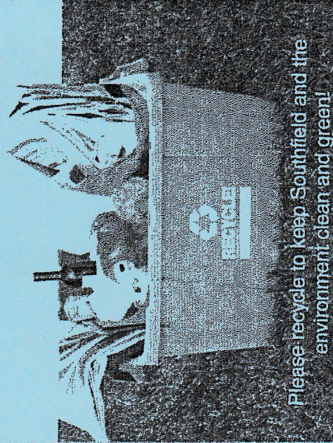
Please recycle to keep Southfield and the environment clean and green!

For more information, contact Southfield Public Works at (248) 796-4860, or visit www.cityofsouthfield.com .