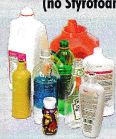
#1-#2 and #4-#7 Plastic containers (no Styrofoam)