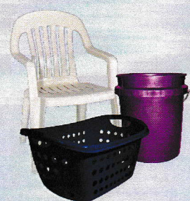
Bulky Rigid Plastic (buckets, chairs, toys)