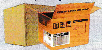
Corrugated cardboard & Paper bags