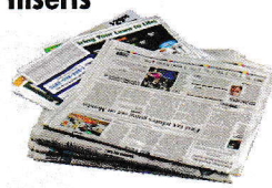
Newspapers, Magazines, Brochures & Inserts