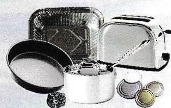
Household scrap metal