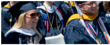
POPE LEO TELLS GRADUATING VILLANOVANS TO UPHOLD AUGUSTINIAN VALUES, RECALL US GUIDING PRINCIPLES

OUR SUNDAY VISITOR (OSV) – May 20, 2026: Pope Leo’s message to graduates, “The world beyond. . . is waiting for you, sometimes with open arms, and sometimes with truly dangerous intent. . . Carry with you those Augustinian values Veritas (truth), Unitas (unity), Caritas (charity).” WWW.OSVNEWS.COM/CATEGORY/US-CHURCH