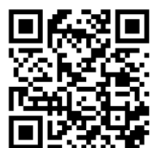
GA 227 Info