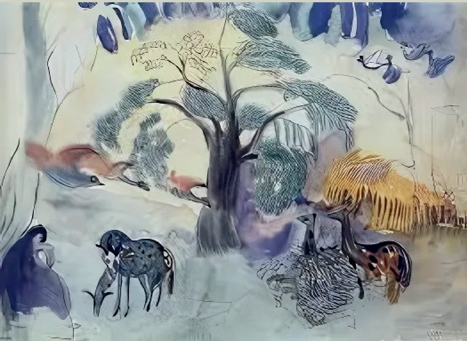
Fairy Tale. Garden of Eden. (1904) by Martiros Sarian

OCTOBER 5TH, 2025 WORLD COMMUNION SUNDAY