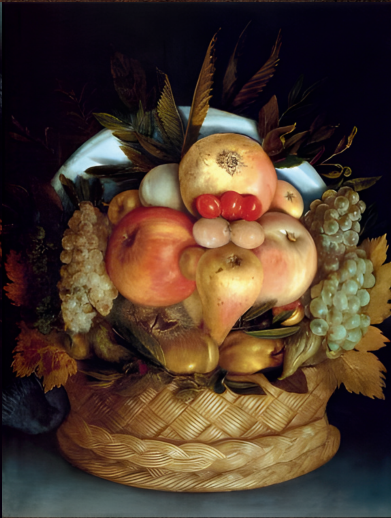
Reversible Head with a Basket of Fruit Giuseppe Arcimboldo, 1590