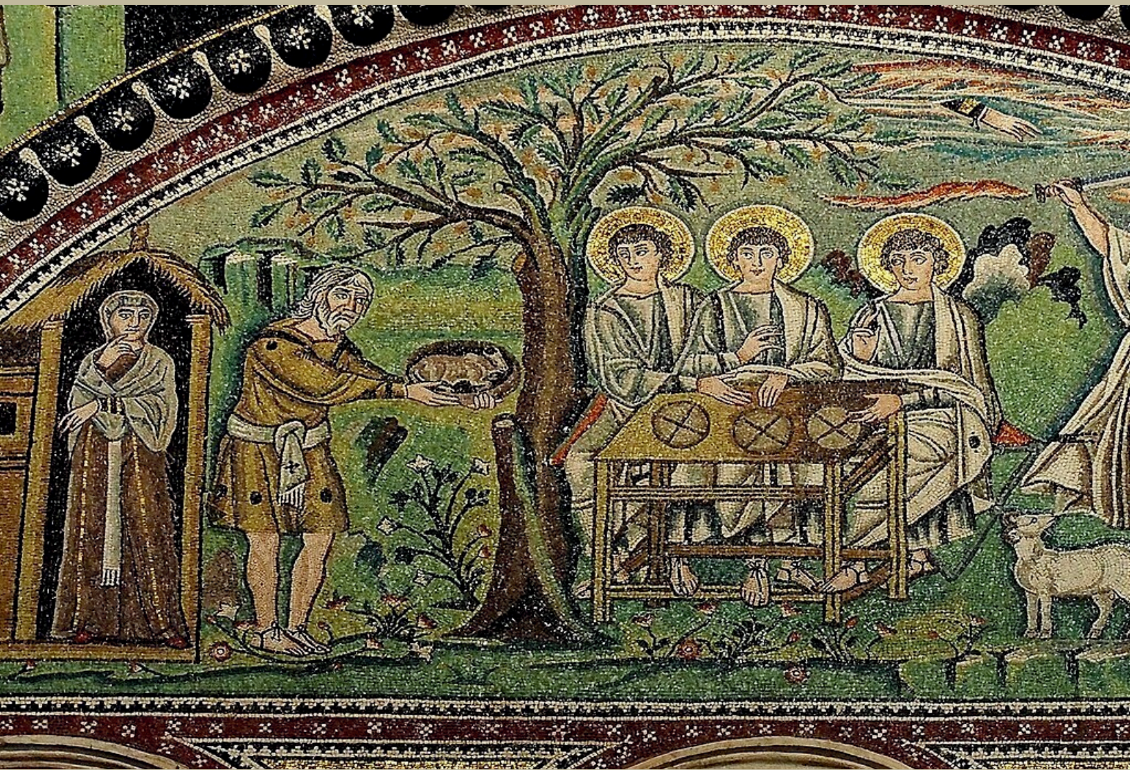
Mosaic depicting Abraham's hospitality (Gen 18:1-15) located in the Basilica of San Vitale in Ravenna, Italy.

AUGUST 31, 2025 12 TH SUNDAY AFTER PENTECOST