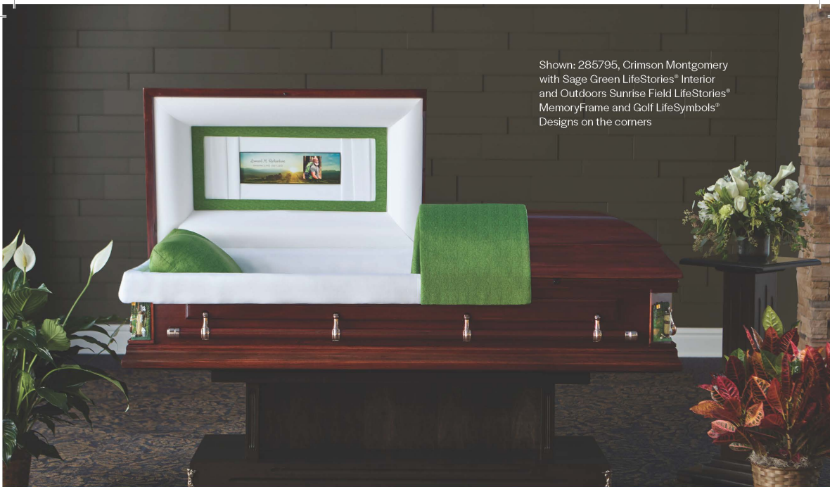
Shown: 285795, Crimson Montgomery with Sage Green LifeStories® Interior and Outdoors Sunrise Field LifeStories® MemoryFrame and Golf LifeSymbols® Designs on the corners

Did you know that 75% of families say personalization is essential— yet only 53% of directors prioritize it.*