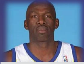
Olden Polynice, NBA