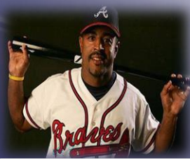
Brian Jordan, MLB & NFL