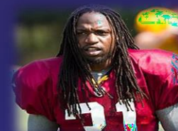
Brandon Meriweather, NFL