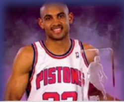
Grant Hill, NBA HOF