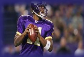
Daunte Culpepper, NFL