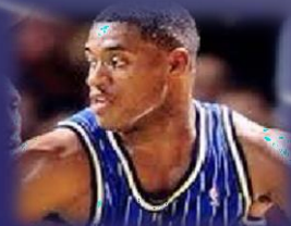
Nick Anderson, NBA