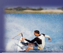
Jake Pelot, Pro Wakeboarder