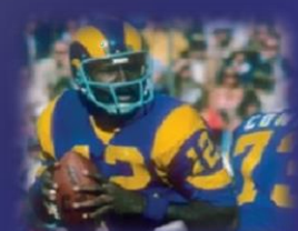
James "Shack" Harris, NFL