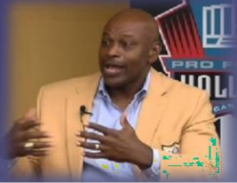
Dwight Stephenson, ProHOF