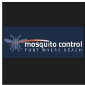
Fort Myers Beach Mosquito Control