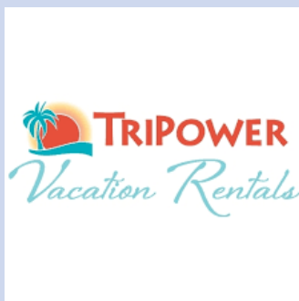
TriPower Vacation Rentals