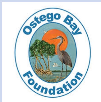
Ostego Bay Foundation