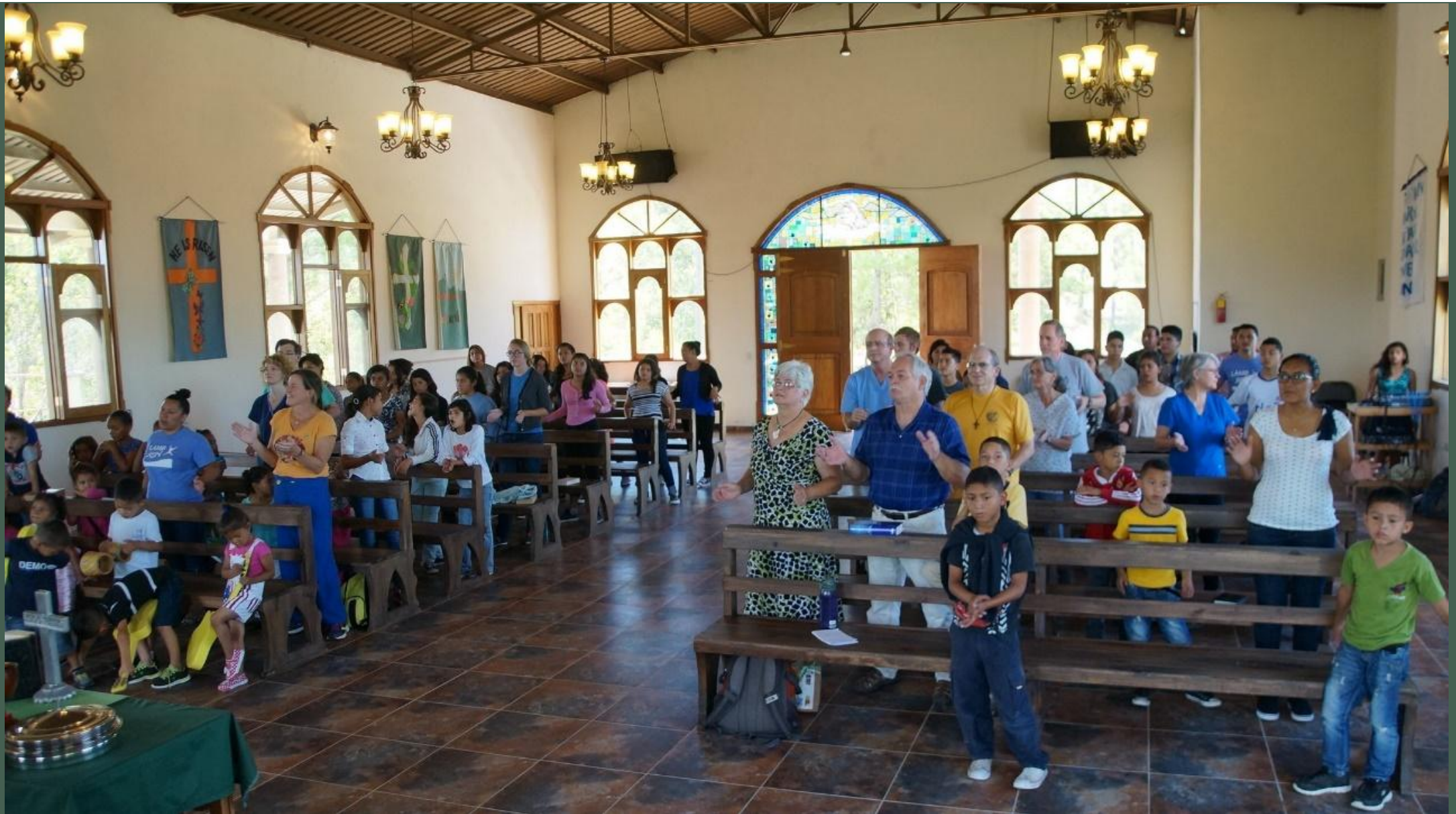
Sunday Worship with the children at the LAMB Children's Home