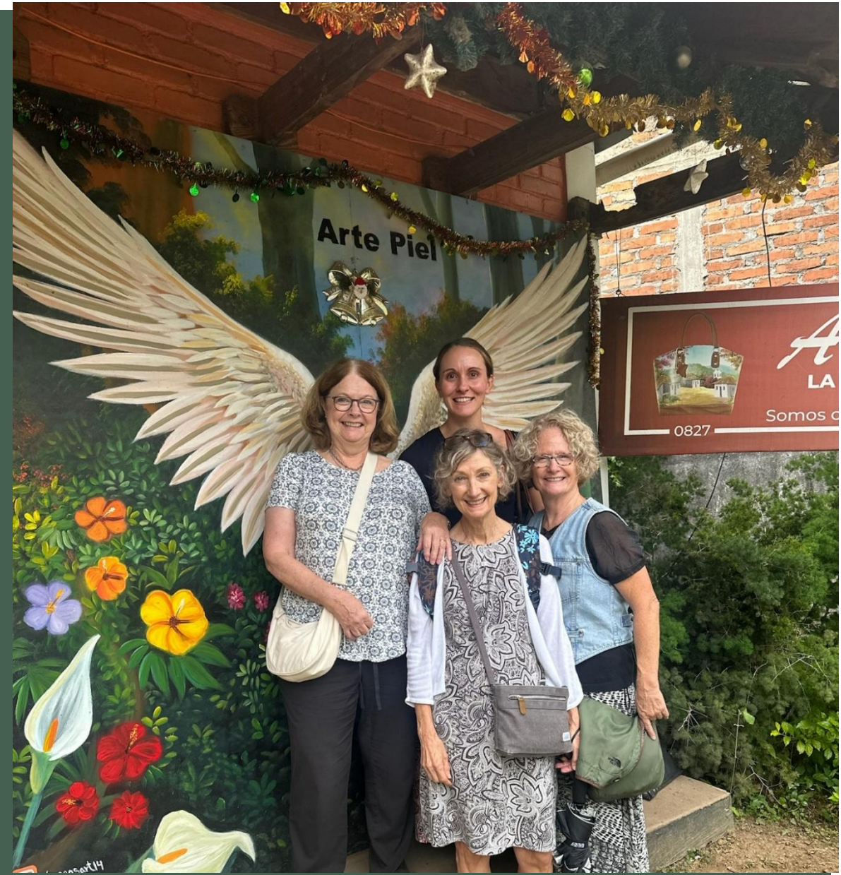
... and some sightseeing in Tegucigalpa