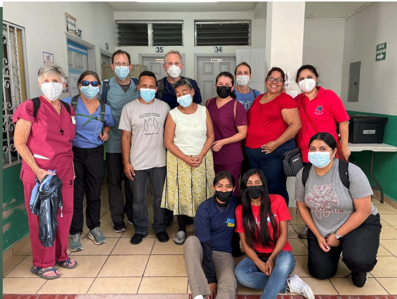
2022 Brigade with Translators