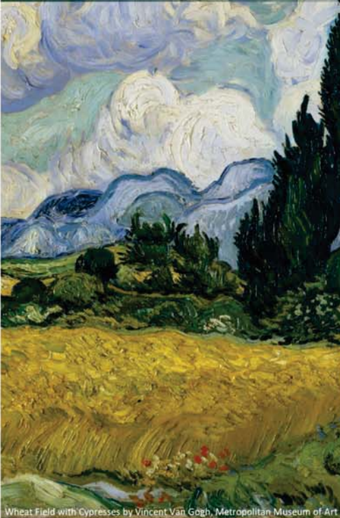
Wheat Field with Cypresses by Vincent Van Gogh, Metropolitan Museum of Art