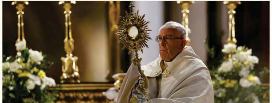
Pope Francis leads Benediction outside the Basilica of St. Mary Major on the feast of Corpus Christi in Rome May 26, 2016

By being united to Christ through the power of the Holy Spirit dwelling in us, we are drawn up into the eternal rela-