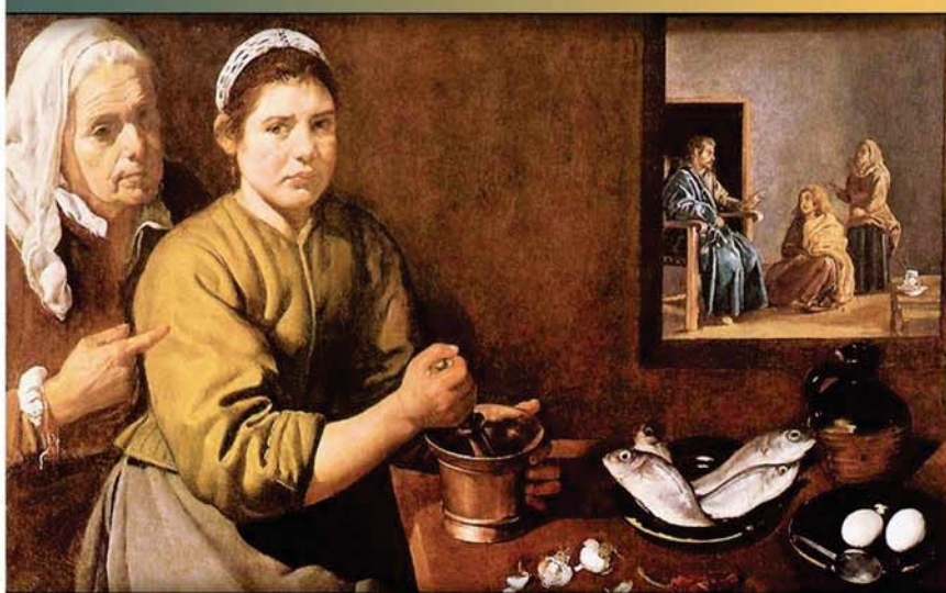
Diego Velázquez de Silva y Velázquez (1620)

Martha, Martha," the Lord answered, "you are worried and upset about many things, but only one thing is needed. Mary has chosen what is better, and it will not be taken away from her." Luke 10:41-42