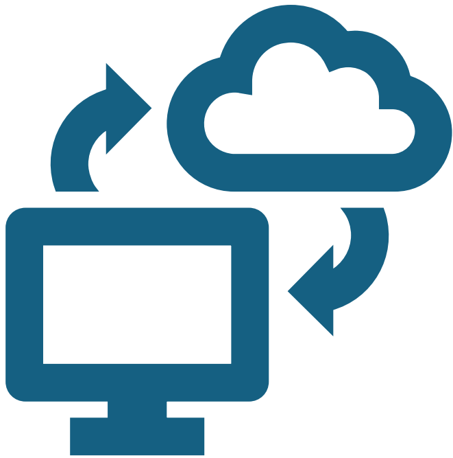
Table Exercise 2: Where Virtual Care Could Help (10 min)