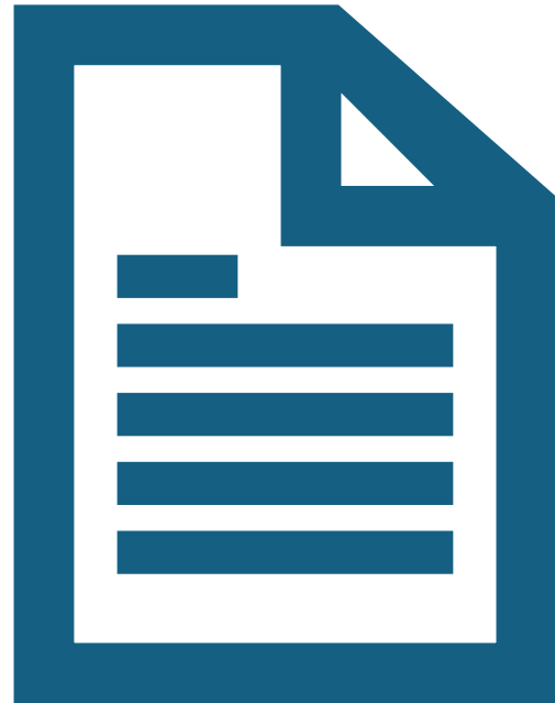
Table Exercise 1: Current Reality (10 min)