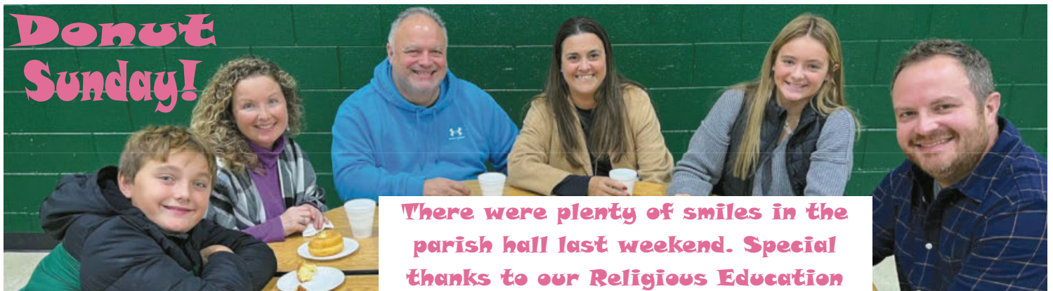
There were plenty of smiles in the parish hall last weekend. Special thanks to our Religious Education Families and Volunteers for arranging this month's Donut Sunday.