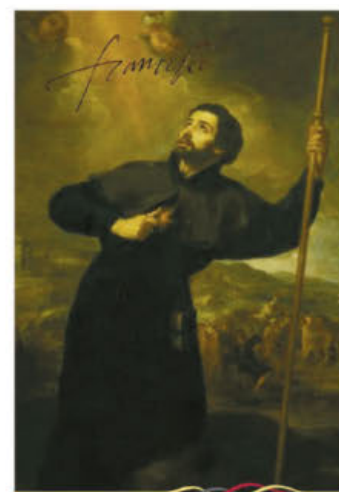
Praying with Saint Francis Xavier The Novena of Grace

God our Father, as St Francis Xavier travelled to the ends of the earth, impelled by love of Christ and afire with his good news, give me the trust and the grace to base all that I do entirely on you, safe in the knowledge that you raise up the lowly and fill them with good things. Through Christ our Lord. Amen.