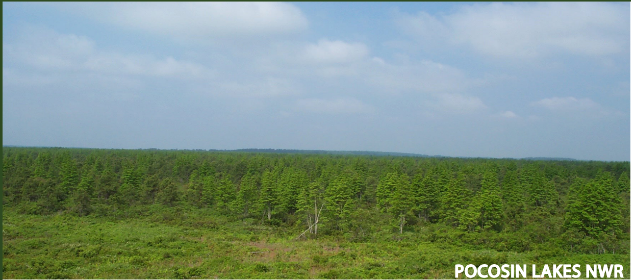
POCOSIN LAKES NWR