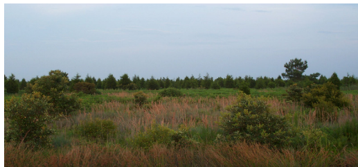
Atlantic White Cedar Swamp Restoration

USFWS, NC WRC, Click Here and Here for more Info.