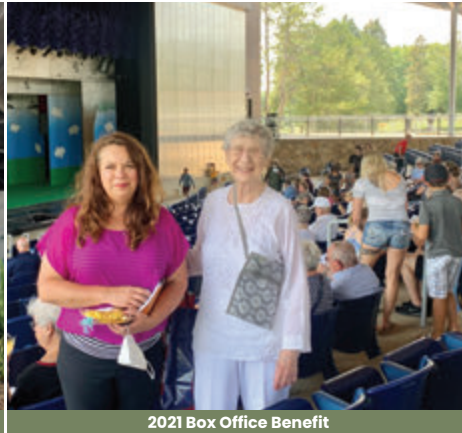
2021 Box Office Benefit