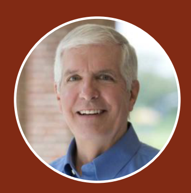
"We have so much richness because of the people that are part of the