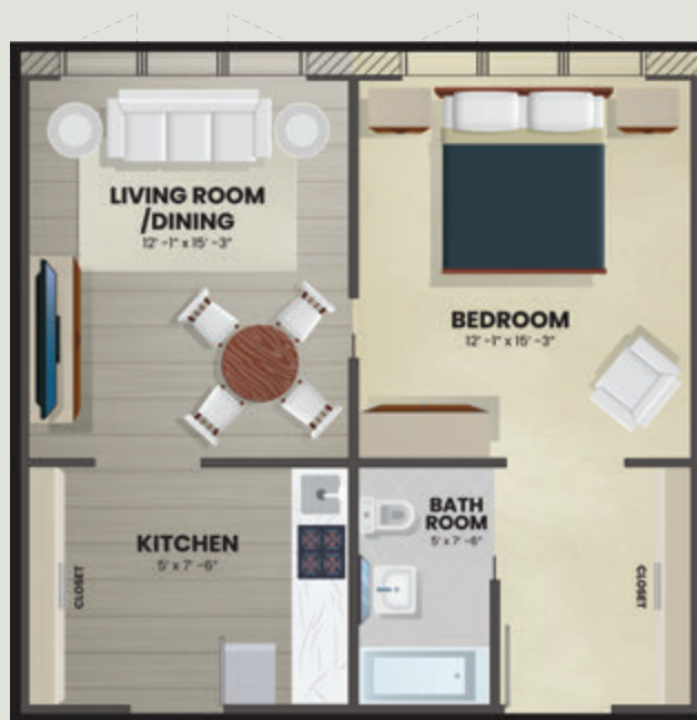
Willows Arbor 1-Bedroom