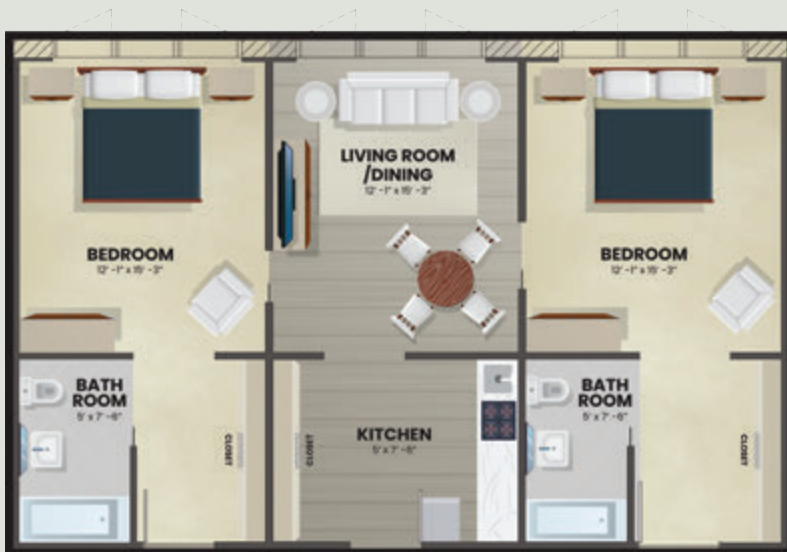
Willows Arbor 2-Bedroom