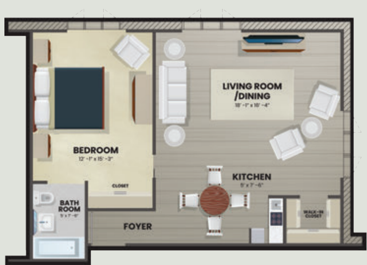
Custom Willows Arbor 1-Bedroom