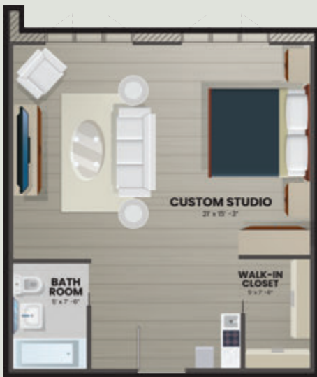
Custom Willows Arbor Studio