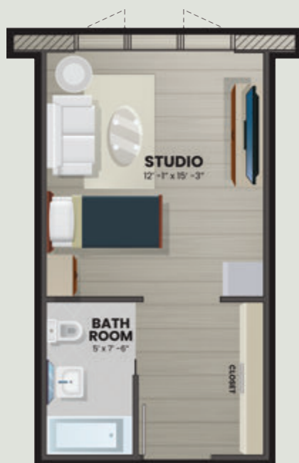
Willows Arbor Studio