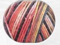
SE678 Kırmızı Siyah Sarı Viola