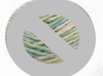
SE484 Marimba Marimba