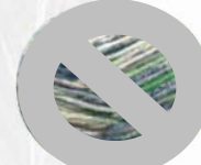
SE492 Lacivert Yeşil Beyaz Harmonica