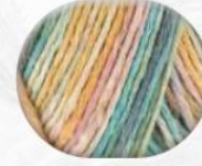
SE679 Yeşil Pembe Sarı Cello