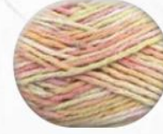
SE495 Sarı Turuncu Beyaz Cymbal

etropil Organik El Örgü İplikleri Designed in Italy