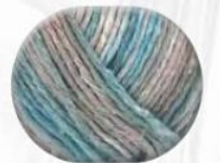
SE680 Gri Beyaz Yeşil Flute