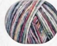
SE676 Kırmızı Siyah Beyaz Piano