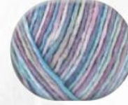
SE675 Mavi Mor Beyaz Percussionsopn