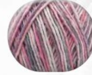
SE488 Mor Lacivert Beyaz Lyre