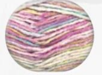
SE493 Pembe Beyaz Mavi Mandoline