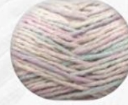
SE482 Bebe Pembe Bebe Mavi Gong