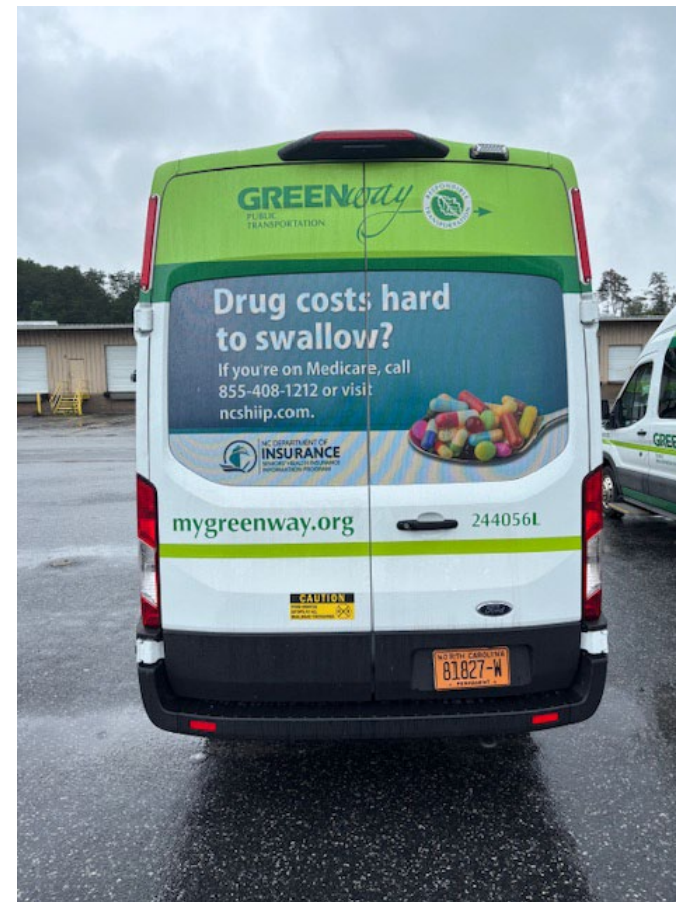
WESTERN PIEDMONT COUNCIL OF GOVERNMENT