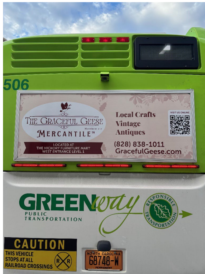
THE GRACEFUL GEESE MERCANTILE