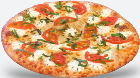
PIZZA ALLA ROSA

Grilled Chicken Meatballs Crispy Chicken Roasted Bell Bacon Pepper Anchovies Artichoke Hearts Breaded Pepperoncini Eggplant Feta Cheese Fresh Spinach Fresh Broccoli Fresh Mozzarella Kalamata Olives Ricotta Cheese Prosciutto