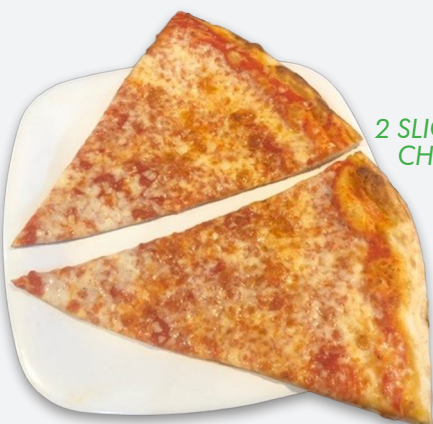
2 SLICES OF CHEESE PIZZA