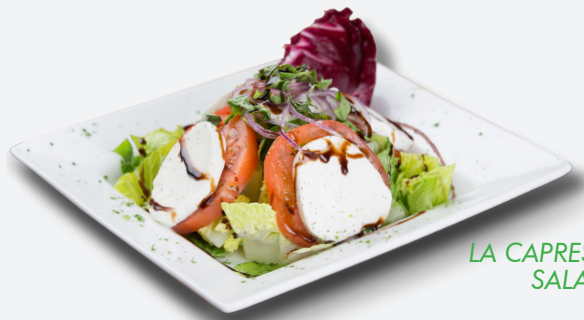
LA CAPRESE SALAD