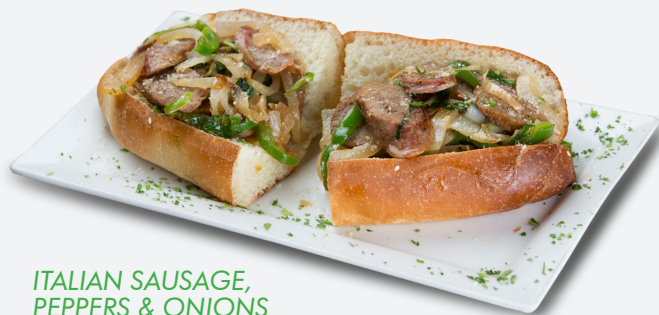
ITALIAN SAUSAGE, PEPPERS & ONIONS

Lightly breaded and baked with tomato sauce and topped with mozzarella cheese with spaghetti.