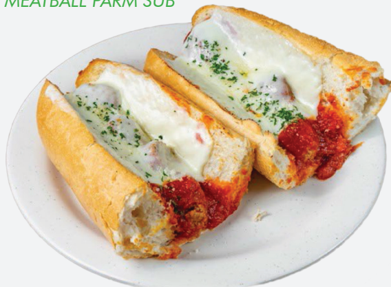
MEATBALL PARM SUB

Crispy chicken with mixed greens, tomatoes, onion, bacon and ranch dressing.