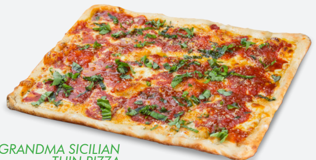
GRANDMA SICILIAN THIN PIZZA