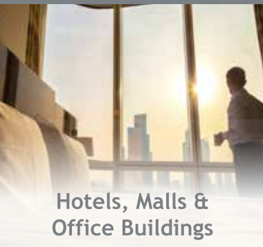
Hotels, Malls & Office Buildings

Have your HVAC professional install our Betterair® purification system today.