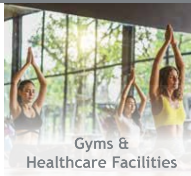
Gyms & Healthcare Facilities