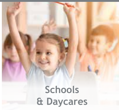
Schools & Daycares