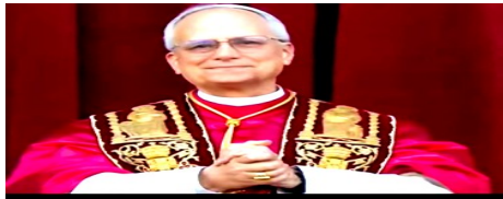
Pope Leo XIV

Pray for the Intentions of the Holy Father - Pope Leo XIV