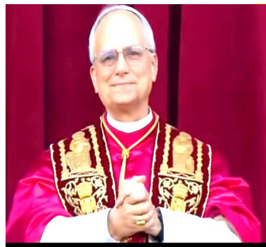
Pope Leo XIV