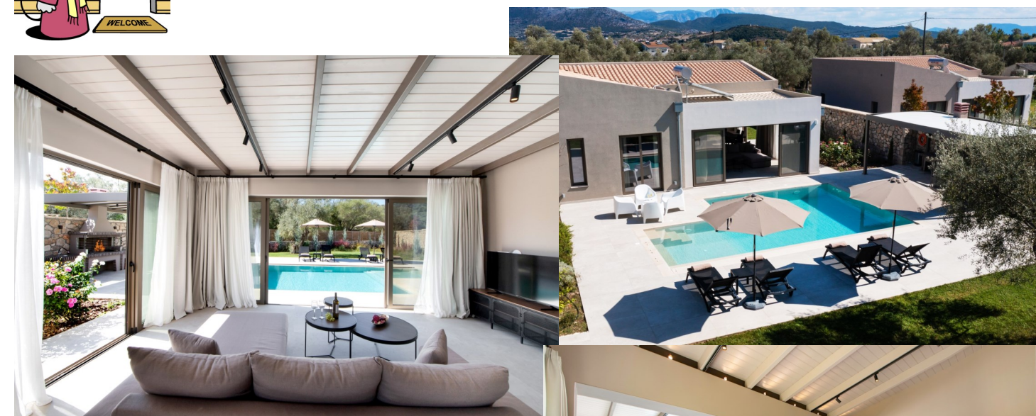
More snaps of the accommodations and the local beach . . .

The musings of one of God's smallest creatures on events in and around the Parish over the past seven days . . .