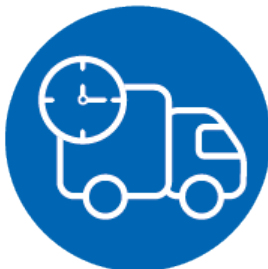
Supply Chain, Logistics & Procurement