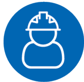
Construction & Engineers