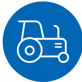
Agriculture & Primary Industries