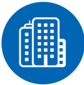
Property & Architecture