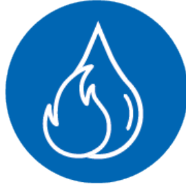
Energy, Oil & Gas