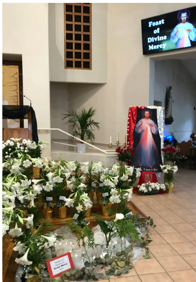
Divine Mercy Sunday 2025

Jesus, you promised St. Faustina that the soul who has been to confession (I have), and the soul that receives Holy Communion (I just did), will receive the complete forgiveness of all sin and punishment. Please give me this grace.