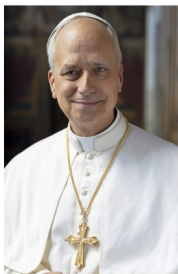
Leo PP XIV

Every steward has been given gifts from the Holy Spirit. These are called "charisms" and they are used to build God's kingdom of earth. While many people are able to recognize their natural talents and abilities, they may be unsure of their charisms. If you know someone who is struggling for a direction in life, give them a little encouragement. Help them discern their charisms and how God is calling them to use them. Remember - no gift is too small or insignificant in God's salvation plan. Diocese of Camden