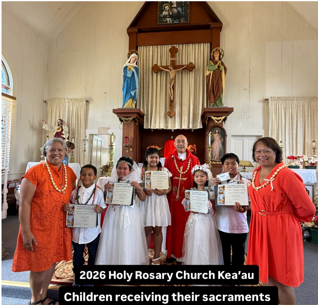
2026 Holy Rosary Church Kea'au Children receiving their sacraments