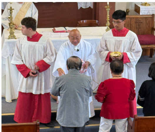
Blessed Mother Home Visitation in the month of May