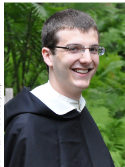
Dominican Friars of St. Joseph

With today's shortage of priests, one might assume that any man entering a religious community would naturally go on to be ordained. Historically, however, this has never been the case. Religious life—marked by the vows of poverty, chastity, and obedience—has always been recognized as a vocation in its own right, distinct from Holy Orders.