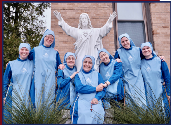
Daughters of Mary of Nazareth

Masthead photo: A young friar prepares for transitus , the Franciscan tradition of celebrating the entrance of their patron saint into heaven. In 2026, the feast will take on special significance, as Pope Leo has declared a special jubilee year recognizing eight centuries of Francis of Assisi's profound influence on the Church.