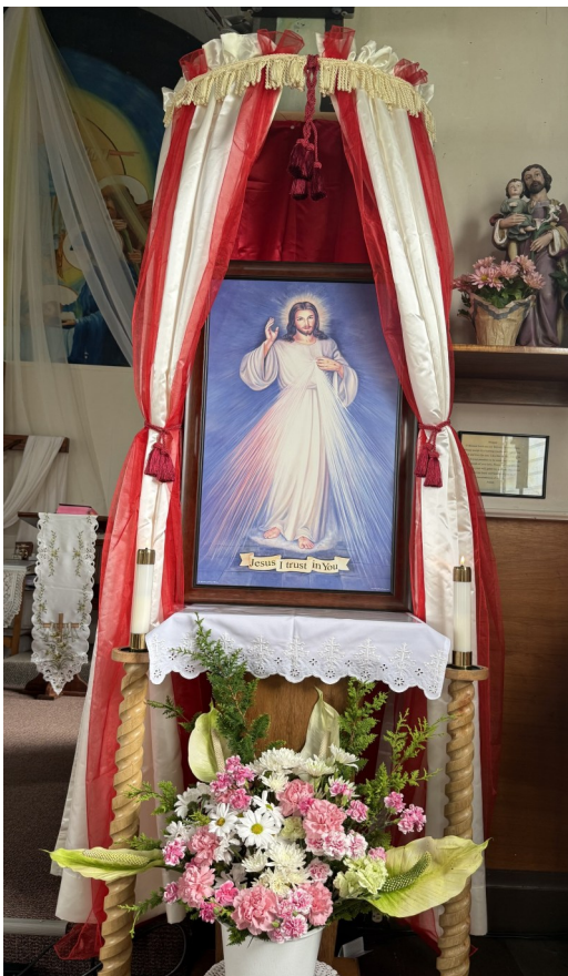
St. Theresa Divine Mercy