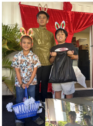
The picture on the left is the winners for the most eggs gathered. Holy Rosary Church First Easter Egg Hunt after Easter Sunday Mass.