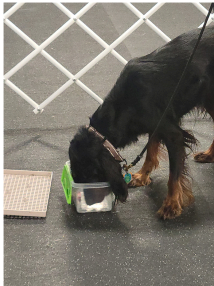
"Babs" at Scentwork class.

At the bottom of the events page you will find a link to the Events Calendar. This will take you to the AKC Event Search & Results. *