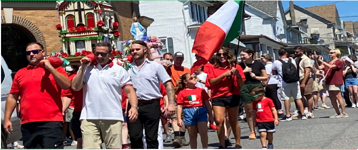
Cinti in the Madonna del Monte & Saints of Cilento Festival procession 2025.

The Madonna del Monte & Saints of Cilento Festival will be held August 7–9. We are seeking donations of large cans of tomato sauce, 12-pack soda cans, bottled water, foil, parchment paper, sturdy plates, napkins, towels, and cutlery. A $25 sponsorship for food is very helpful—any donation is appreciated.