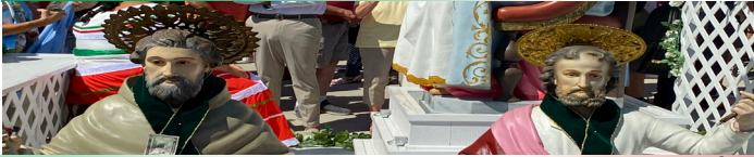
Saints of Cilento Statues in the Madonna del Monte & Saints of Cilento Festival procession 2025.

The Madonna del Monte & Saints of Cilento Festival will be held August 7–9. We are seeking donations of large cans of tomato sauce, 12-pack soda cans, bottled water, foil, parchment paper, sturdy plates, napkins, towels, and cutlery. A $25 sponsorship for food is very helpful—any donation is appreciated.