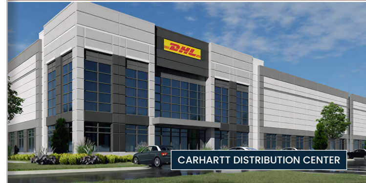
CARHARTT DISTRIBUTION CENTER