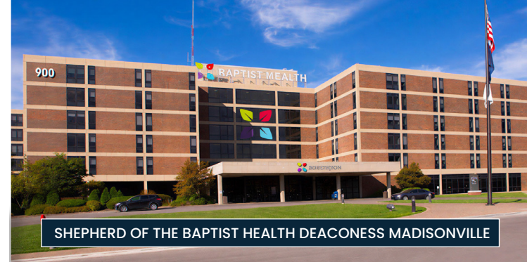
SHEPHERD OF THE BAPTIST HEALTH DEACONESS MADISONVILLE