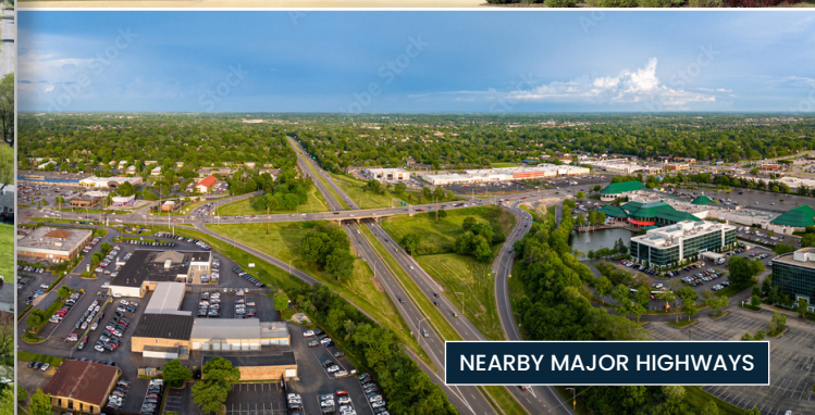
NEARBY MAJOR HIGHWAYS