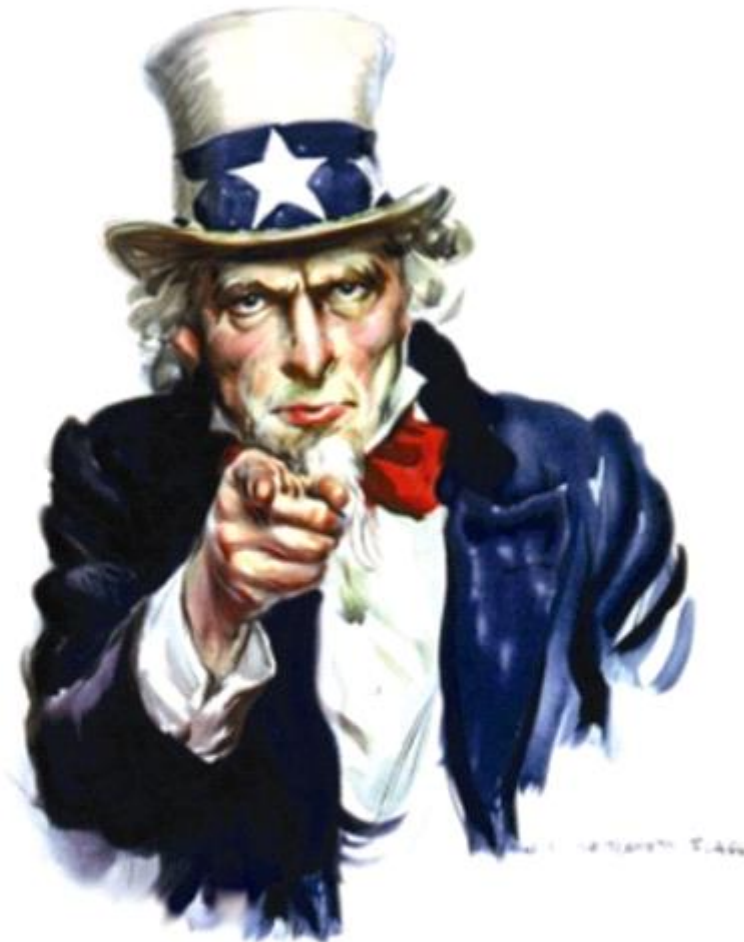
Table Bay Financial Network, Inc.