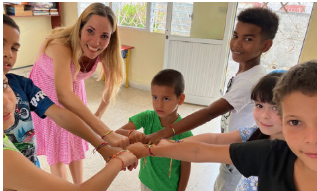
Pictured left: Children at Central Reformed Presbyterian Church in Matanzas, Cuba, make friendship bracelets.