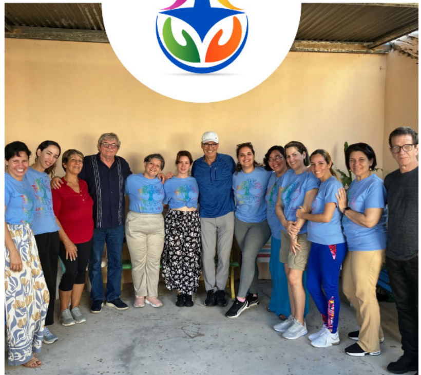
Clockwise from top left: Making friendship bracelets in Matanzas, Cuba; Mission tour of Youth Haven in Naples; FPC Naples parishioners with our Cuban partner church; Central Reformed Presbyterian Church in Matanzas