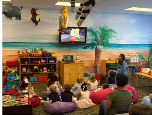
Clockwise from top left: Youth Group Games, On the Beach for FPC Wellness, Dinner in the Courtyard, Nursey Fun, Palm Sunday