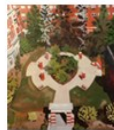
Cathedral Prayer Garden