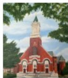
St. Rose of Lima