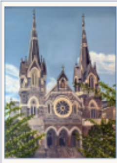
St. John, Pittston