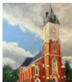
St. Mary of Mount Carmel