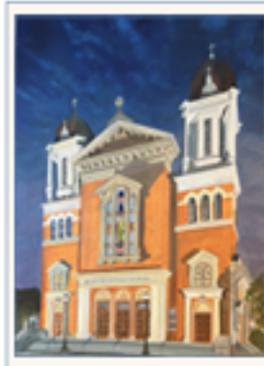
Cathedral of St. Peter