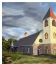
St. Mary of Vilna