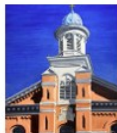
St. Thomas Aquinas