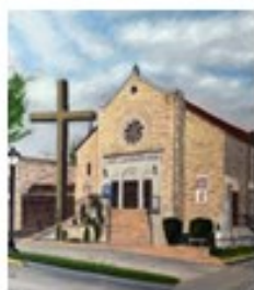
St. Luke Church