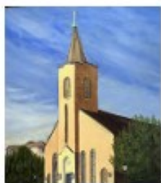
St. Mary of Czestochowa