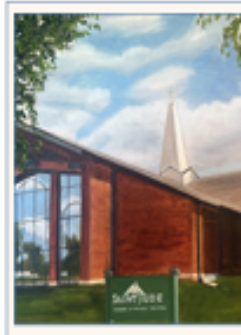
St. Jude Church