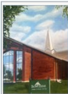
St. Jude Church