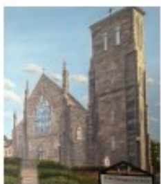
St. John, Honesdale