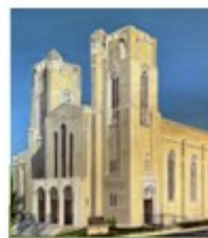
St. Matthew Church