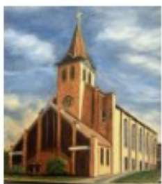
Sacred Heart of Jesus