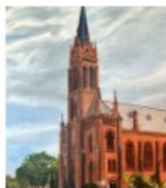
St. Nicholas Church