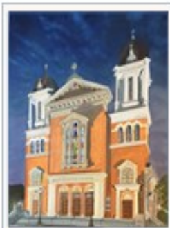
Cathedral of St. Peter