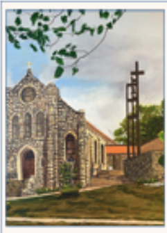
St. Catherine of Siena