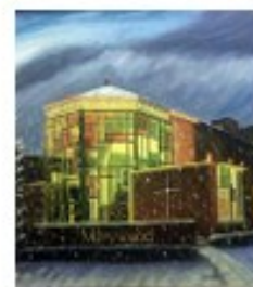
Marian Chapel, Marywood