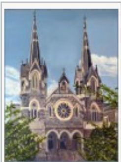
St. John, Pittston