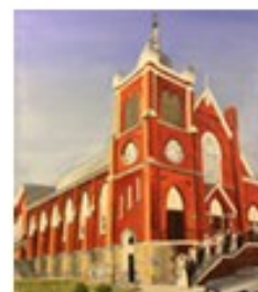
St. Patrick Church