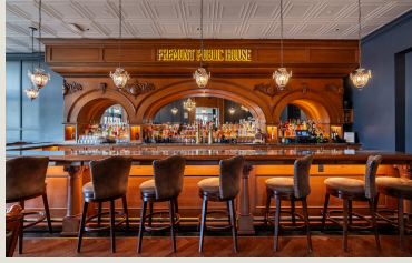
Fremont Public House

From early morning risers to midnight mavericks; from intimate affairs to grand parties, we have something for everyone.