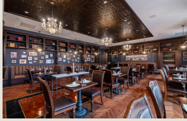
1887 Historic Eatery