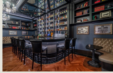
The War Room