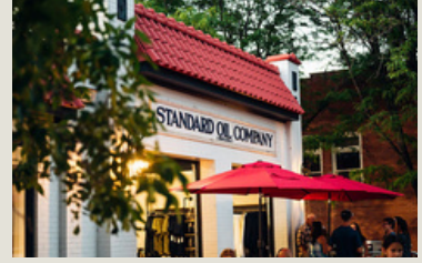
Standard Oil Coffee Co.