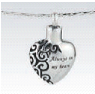
ALWAYS IN MY HEART