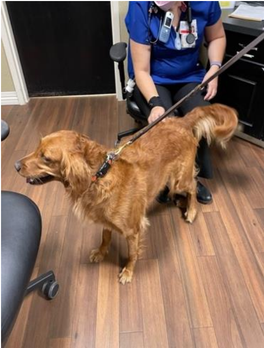
Jessie says, “Yes, right there!”