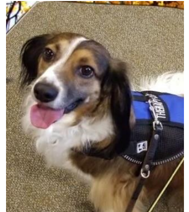
Yogi wants one too!