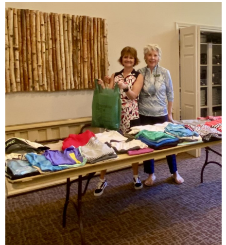
A clothing swap was a good idea!