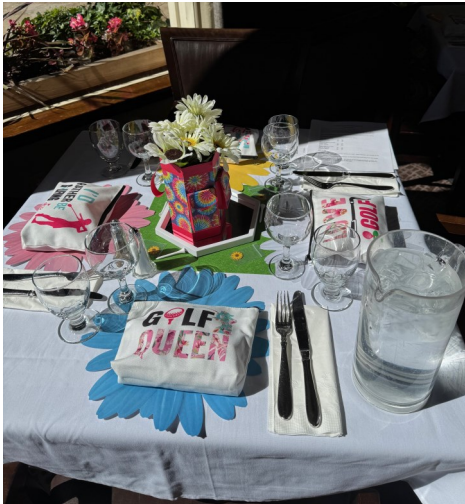
"Goody Bags" for the season's final luncheon