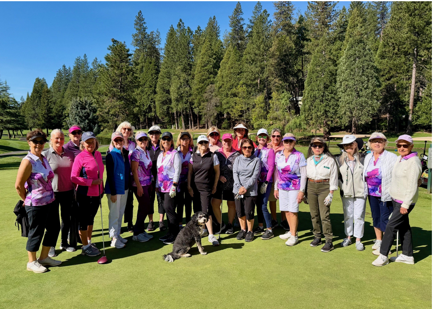
The Sequoians Team 2026