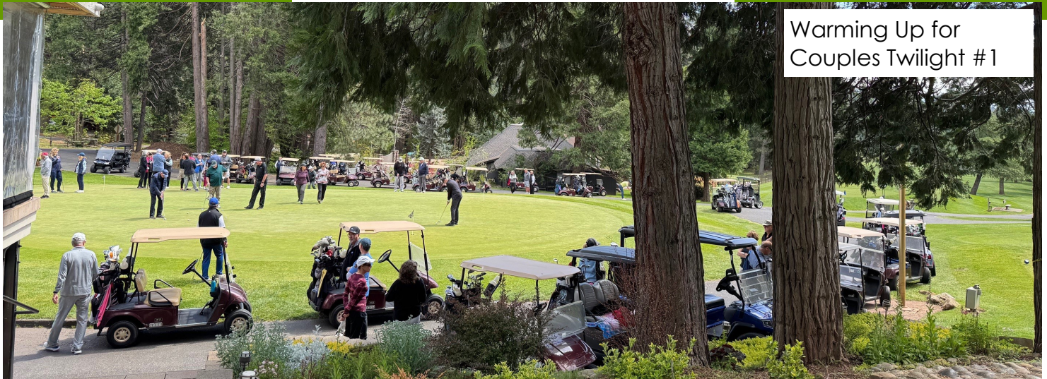
Warming Up for Couples Twilight #1

The Sequoia Woods Country Club Newsletter