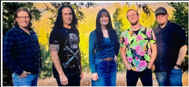
May 23 flashback

guaranteed reservations required and accepted one month before event ...call 209-795-1000 x 1