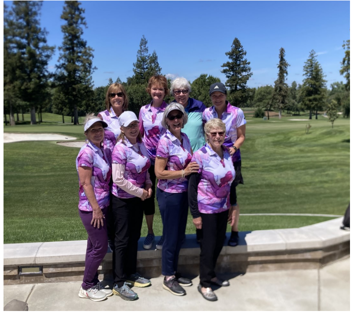
Del Rio CC - Team Play