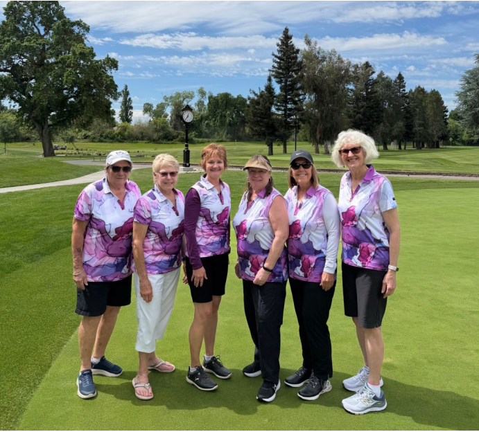
Woodbridge CC - Open Day