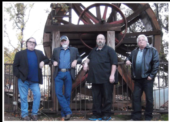
July 4 fabulous off brothers