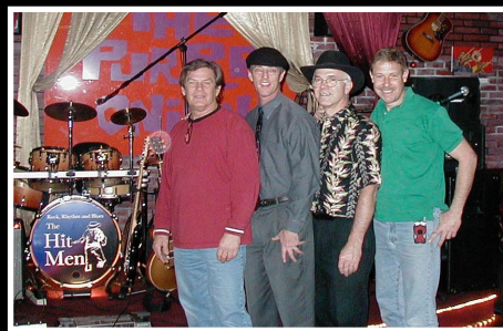
August 8 the hit men