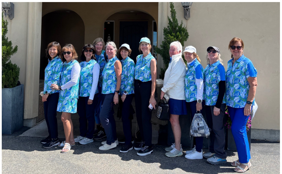
The SWWGC Team at La Contenta