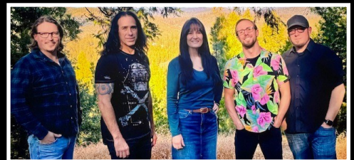
September 5 flashback