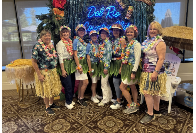
Sequoians: Del Rio CC - Team Play