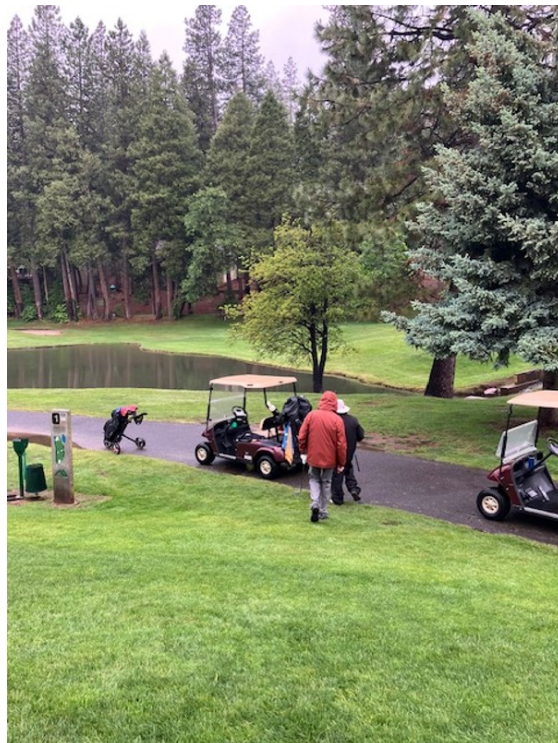
A wet and cold ending to May!

The team is looking forward to a warmer, sunnier month for our Men vs. Women Tournament coming up on June 17 th and our Par 3 Tournament on June 25 th .