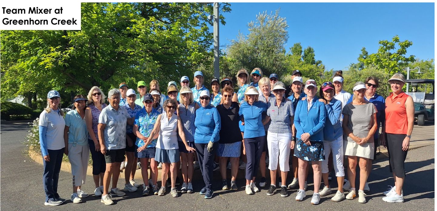
Team Mixer at Greenhorn Creek