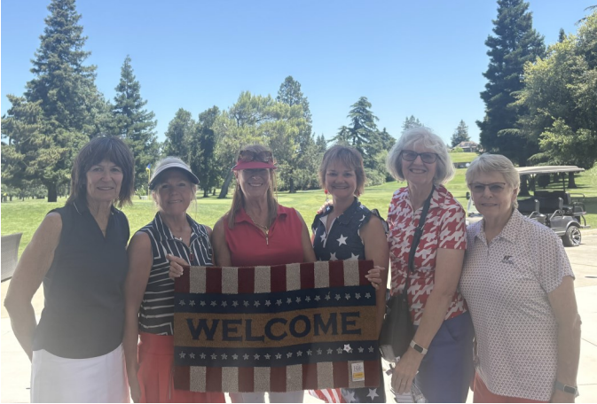
Sequoians: Woodbridge CC - Open Day