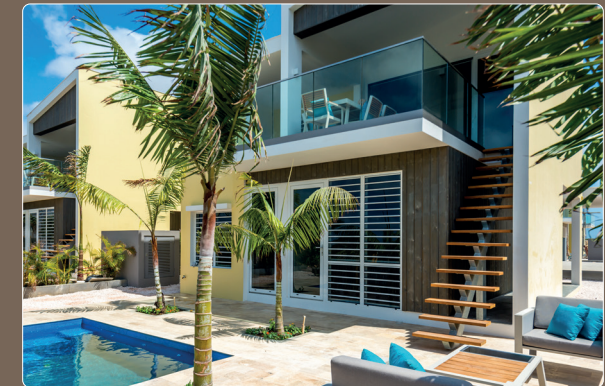
20 luxurious villas