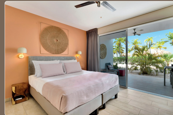
148 comfortable hotel rooms, studios & apartments

Plus, a drink and a bite to eat are always within reach, as the resort holds four different restaurants on site and most accommodations are equipped with a modern kitchen.