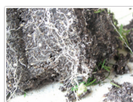
15-0-15 + TCS AMP-XC