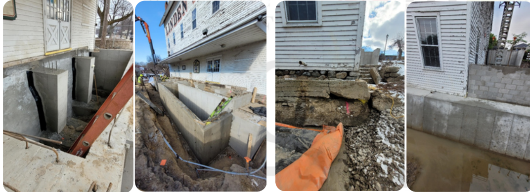
South Foundation Anchoring, Stabilization & ADA Ramp Configuration

The early phases of the Linden Mill Project have progressed slowly as contractors worked through the meticulous & highly technical task of repairing the Mill Building's deteriorating foundations (photos below). As that work draws to an end, residents & visitors should begin to see more visible progress as exterior improvements become the focus in the coming weeks. If all goes well, the Mill Building should be completed and open in late fall or early winter.